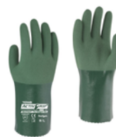
ActivGrip™ 566 length: 12inch(30cm)