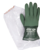
ActivGrip™ 567 available with heat-sealed PVC sleeves overall length: 24inch(60cm)